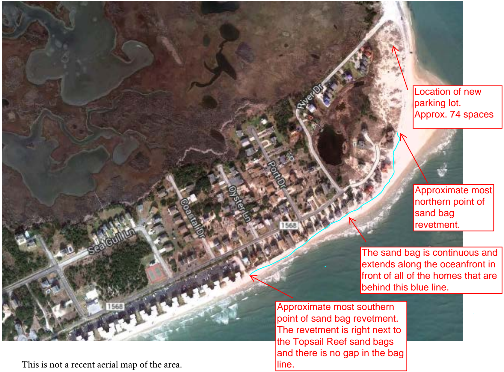
This is not a recent aerial map of the area.